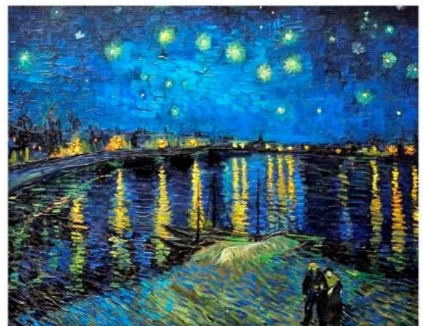
Starry Night- Vincent van Gogh

As part of the PSHE and Wellbeing Programme and this Block's Performing Arts theme, students have talked about emotions and how these can be expressed through artwork. Did you know that as we develop, we begin to associate certain images with emotions? For example, we might come to associate a sunny day with playing in the park. When we make art, we share our own experiences of life with those of our viewers, thus making emotional art.