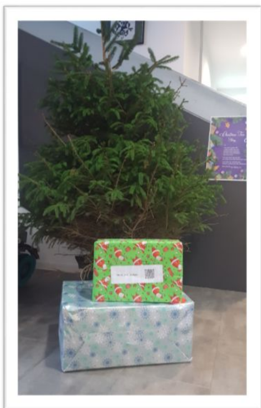
The first presents going under the tree

A huge thank you to ALL students, parents and staff for participating in our Three Winter Godfathers' Project. Thanks to all of you, BISL are already helping to bring joy to over 80 children this holiday season. We only have 20 letters left! These last letters are requesting presents that are more expensive than the previous ones, perhaps year groups/families/teachers could chip in to buy one present. Or some presents could be purchased secondhand on http://www.bolha.com/ . Please don't forget to attach the code securely to the top of the wrapped present and tick off that you have brought the present to school, next to your name.