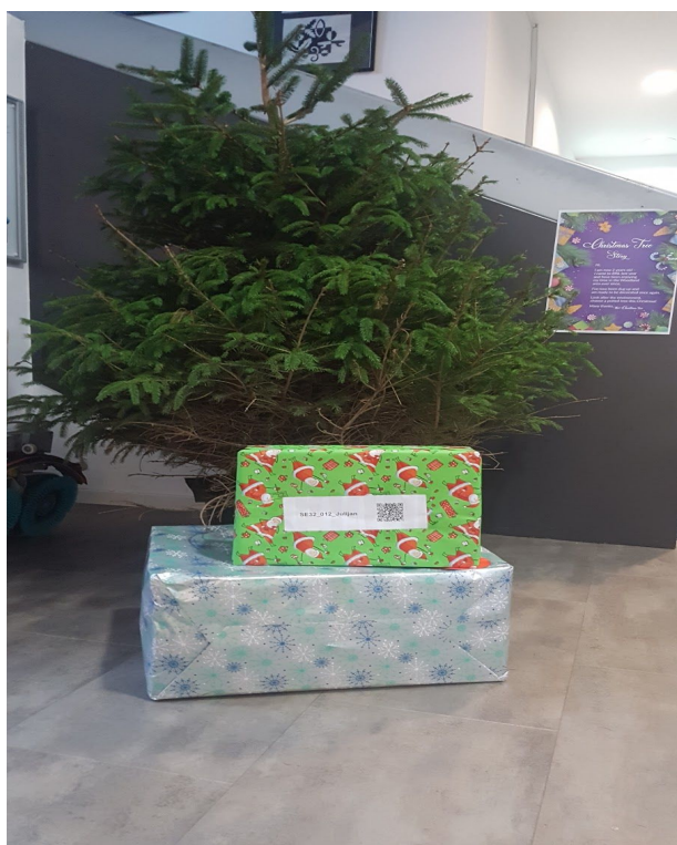
The first presents going under the tree

Thank you as always for your continued support, Caring for the Community & PTA